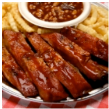
Best Southern BBQ