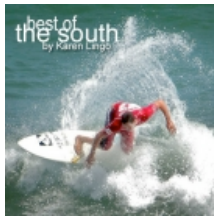
Surf the South's Coast