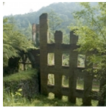
Perfect Picnic Spots in the South