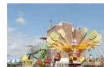
Family Fun Day Rice Festival

Red light violation for September 19, 2011