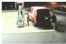
9-year-old girl drives for drinking dad Oct 18, 2011