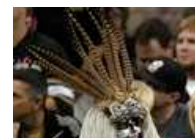
Saints vs. Colts